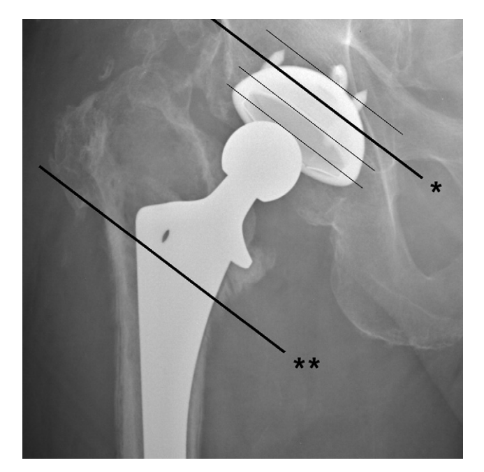
Fig. 1. Guidelines for determining simulation film shielding status. If either the acetabulum or femur was shielded, the film was scored as shielded. Acetabular shielding was determined by dividing the distance between the widest point of the acetabular cup and the top of the dome of the prosthetic acetabulum into three parts. If more than one-third of the acetabulum was shielded (asterisk), it was considered shielded. Femoral shielding was determined by drawing a line between the base of the greater and lesser trochanters. If the treatment field did not completely encompass the femoral region proximal to this line (asterisks), the femur was scored as shielded.

Additional patient information obtained from medical chart review included: age, sex, history of HO, timing of RT prophylaxis (hours preoperatively and postoperatively), RT dose, field size, and whether or not the THA was a revision after a prior THA complicated by chronic periprosthetic joint infection.